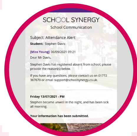
Click through to the message